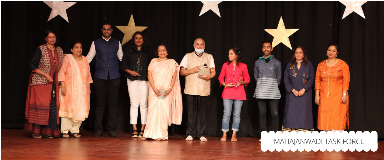
MAHAJANWADI TASK FORCE