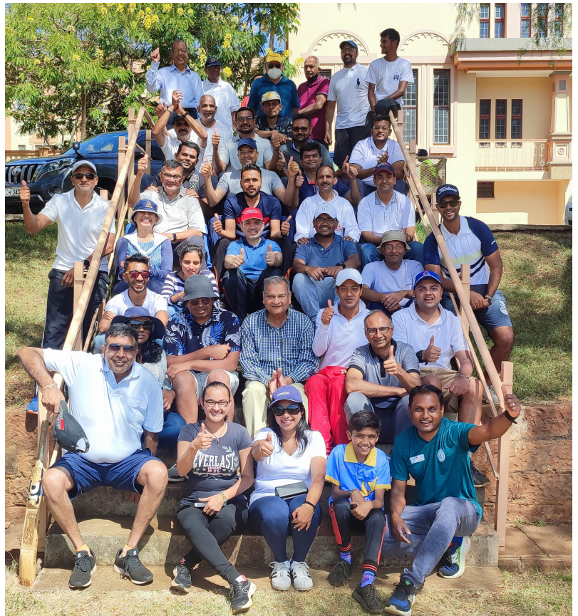
Various Sub-Committee Members who attended the Oshwal Centre Grounds Cricket Pitch opening.