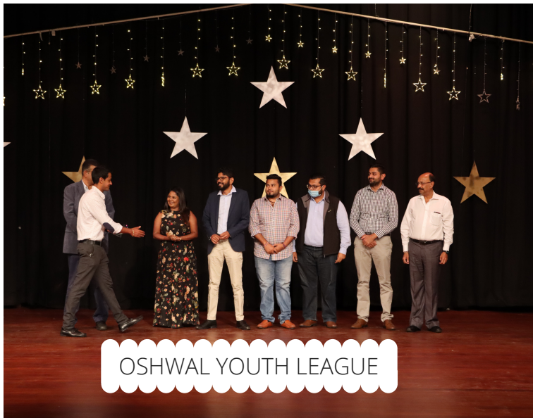
OSHWAL YOUTH LEAGUE