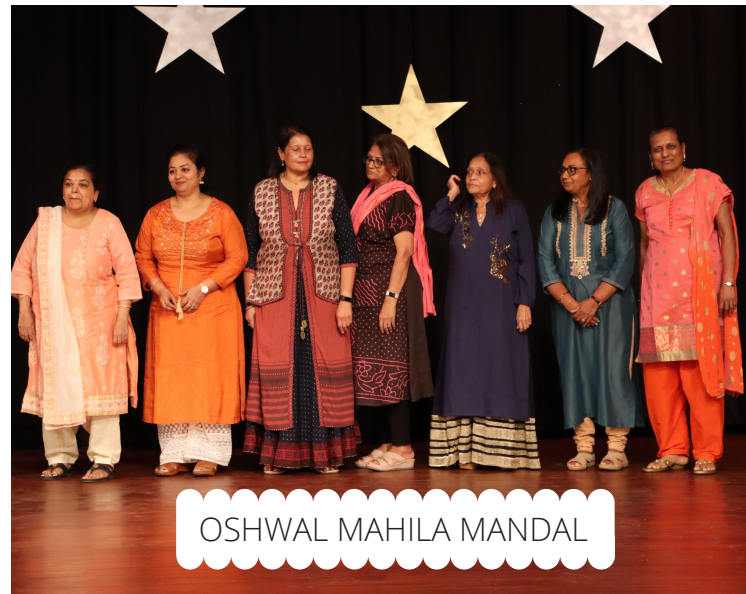
OSHWAL MAHILA MANDAL