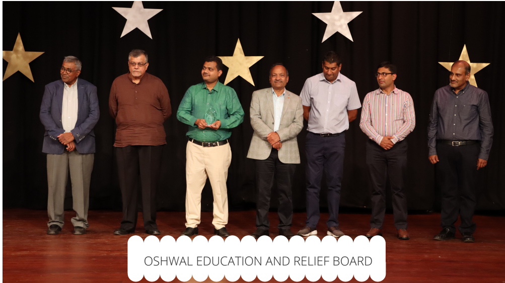
OSHWAL EDUCATION AND RELIEF BOARD