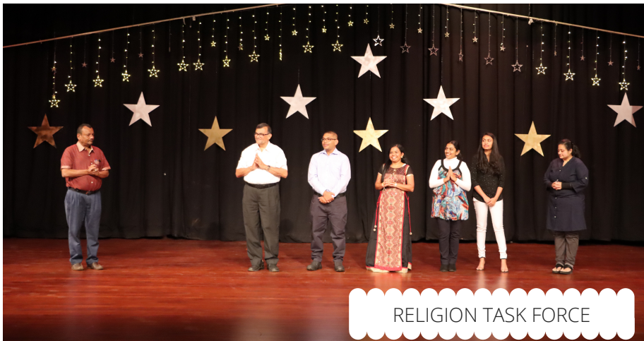
RELIGION TASK FORCE