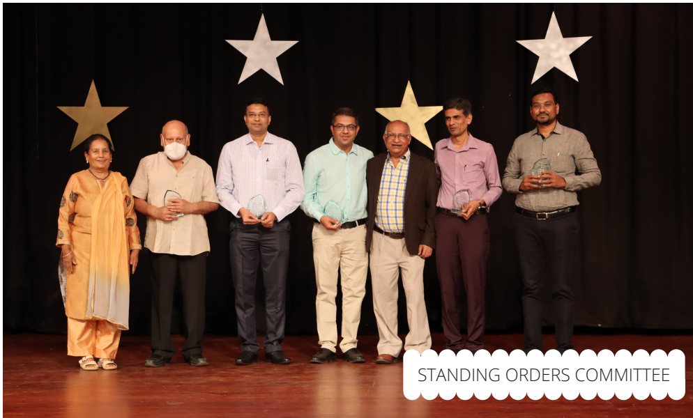
STANDING ORDERS COMMITTEE