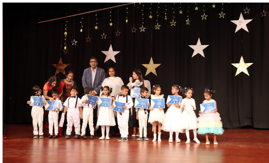
CULTURAL PROGRAM THE OSHWAL ACCADEMY NURSERY, PRIMARY, JUNIOR HIGH & SENIOR HIGH STUDENTS