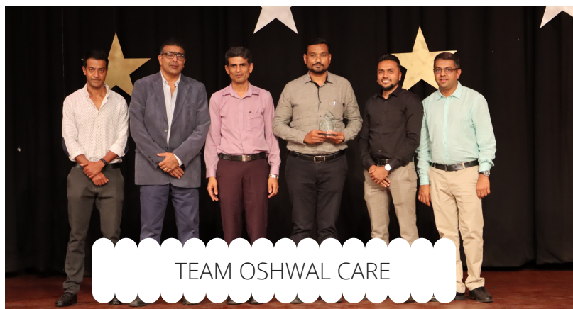
TEAM OSHWAL CARE