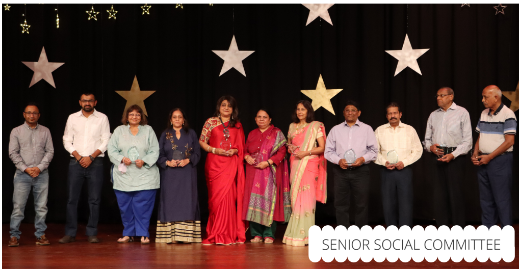
SENIOR SOCIAL COMMITTEE