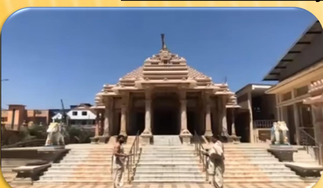
Shree Munisuvrat Swami Jinalay Derasar – Limuru Road Mahajanwadi, Nairobi - Kenya