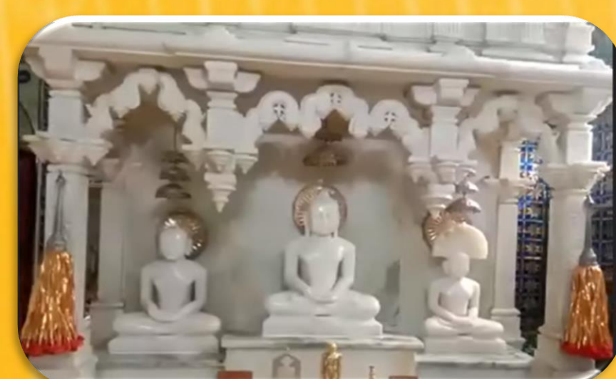
Jain Samaj Leicester