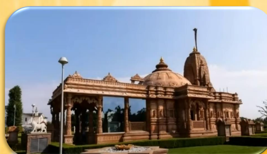
Jain Temple, Potters Bar Derasar - UK